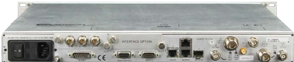
CDM-760 Back Panel

Carrier-in-Carrier® is a Registered Trademark of Comtech EF Data DoubleTalk® is a Registered Trademark of Raytheon Applied Signal Technology